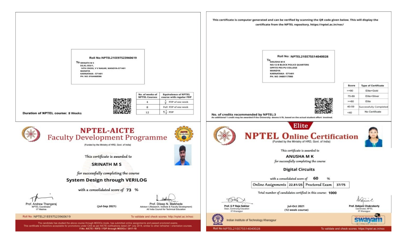
Fig: 4.6<sup>©</sup>: NPTEL-AICTE FDP online certificate of our faculties.

Faculty members use various pedagogical methods for the effective teaching-learning process. The Department has taken the following pedagogical initiatives: